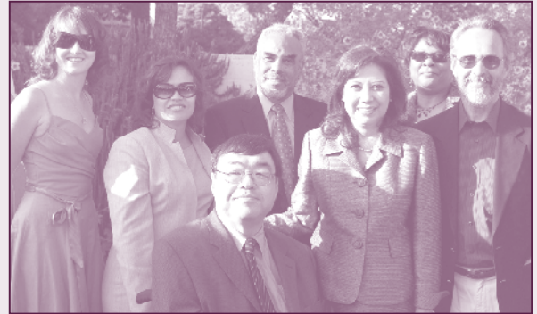
United Way and its partners in the L.A. Workforce Systems Collaborative hosted a reception to honor new Secretary of Labor Hilda Solis. Members of the Collaborative are pictured with Solis (third from right).

Unemployment in L.A. County is now in the double digits for the first time since the early 90's. But, in reality, we've been experiencing steep job declines for years. Since we launched our poverty plan 3 years ago, United Way of Greater Los Angeles has been focusing on job readiness, literacy and training. Our work helps ensure that businesses have the talent they need to make our communities more productive and ultimately more competitive. But in this dynamic economy, accomplishing this goal is easier said than done. It takes business, labor, education and nonprofits working together to find the right solutions. We've taken a leadership role in making this partnership work.